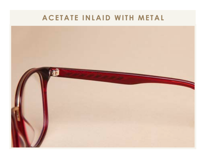
Weaved colour acetate inlaid with metal