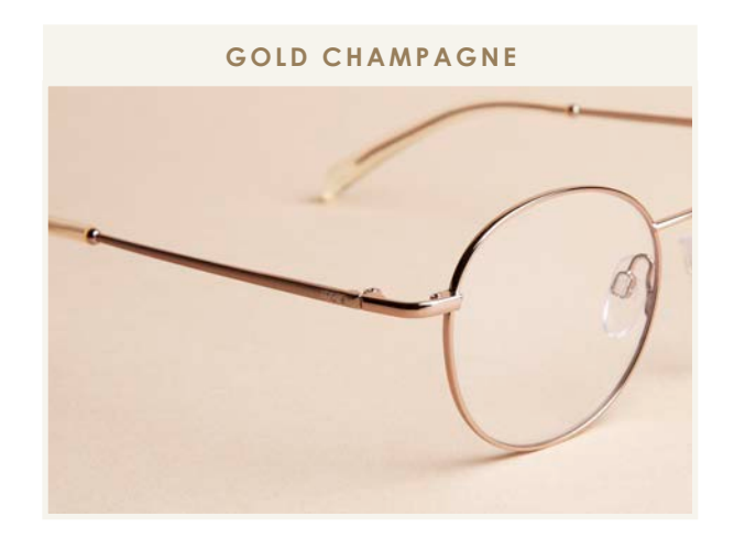
A new gold, vey light and chic