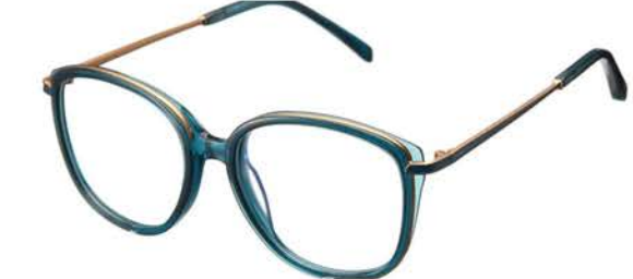
152 Black Weave 211 Black Havana