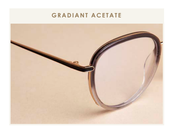
Gradient acetate on a crystal black colour