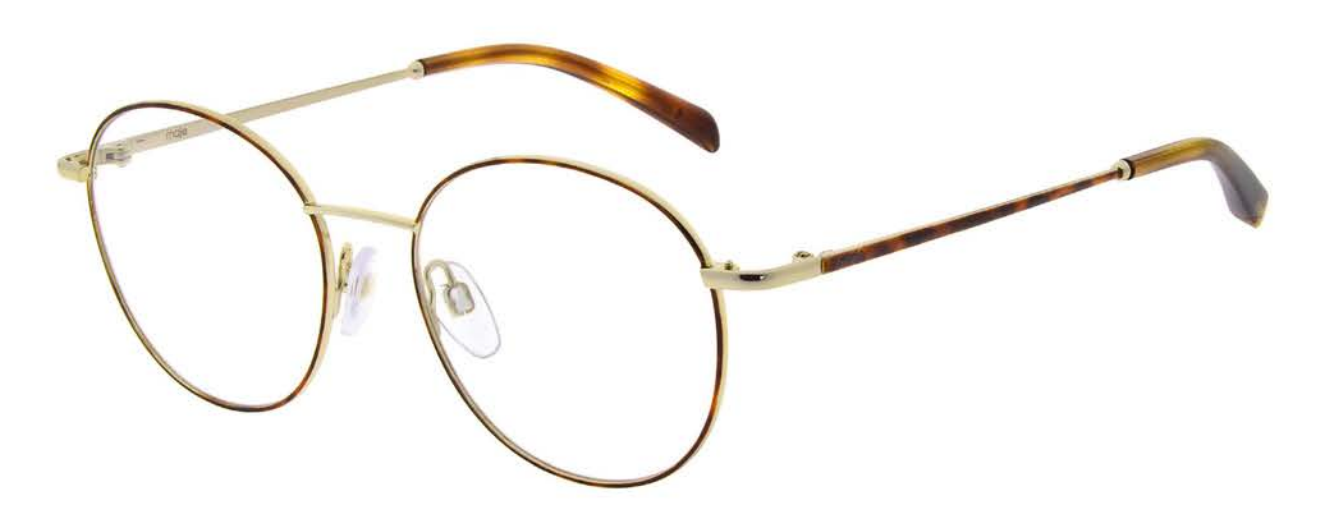
911 Colour 911 of MJ3001 size 48