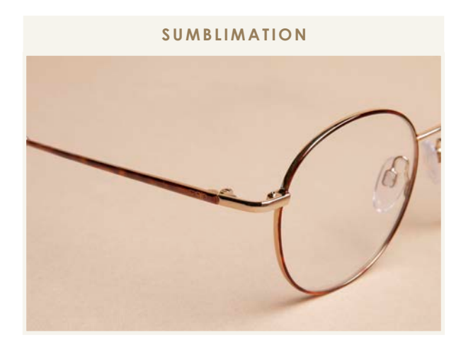
Subtle sublimation on a thin metal rim