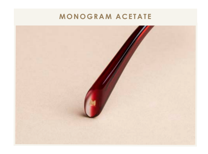
A monogram acetate with shadow