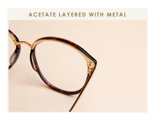
Crystal acetate layered with metal top bar